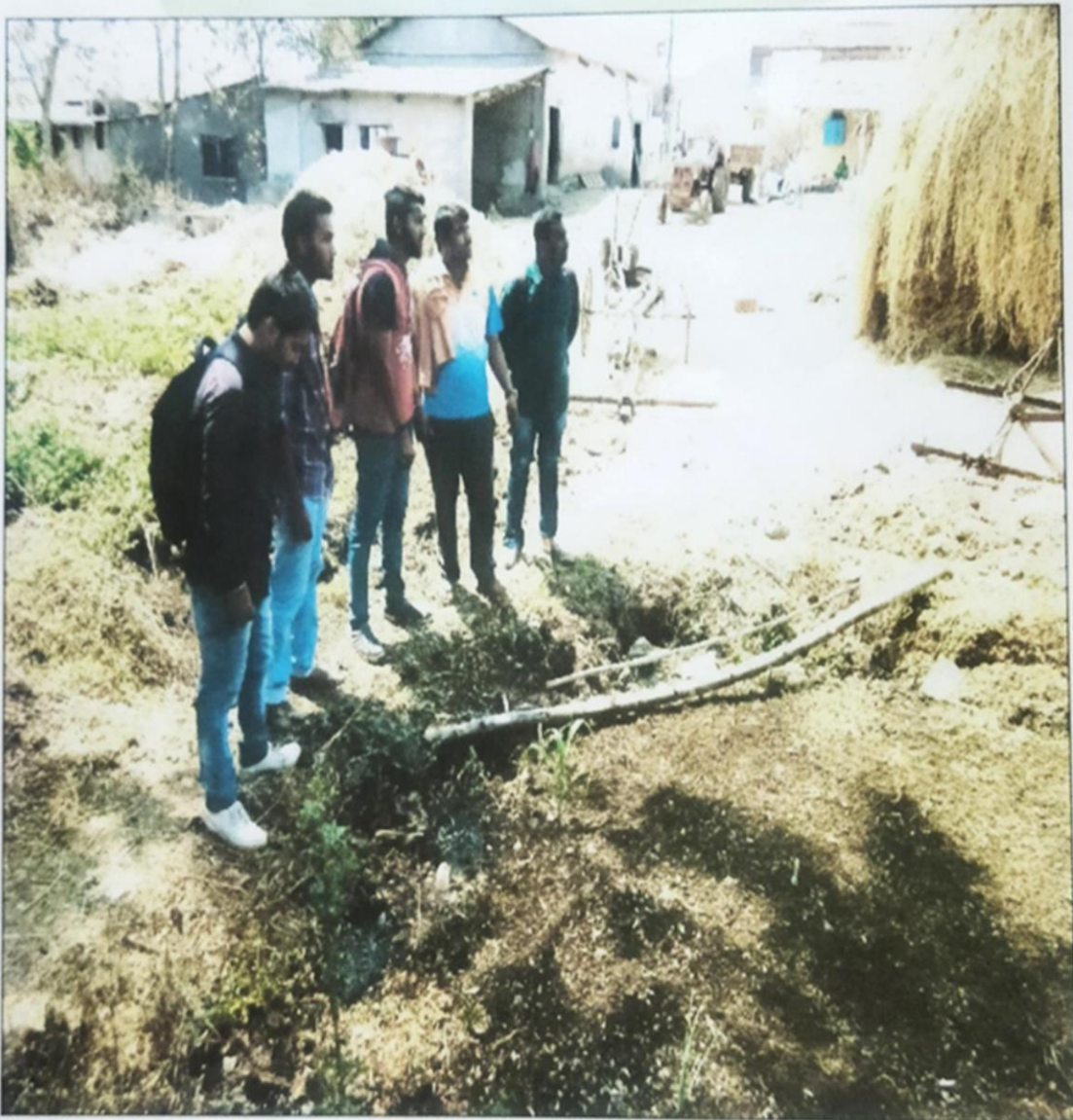
Students visit: At Bio Gas Plant