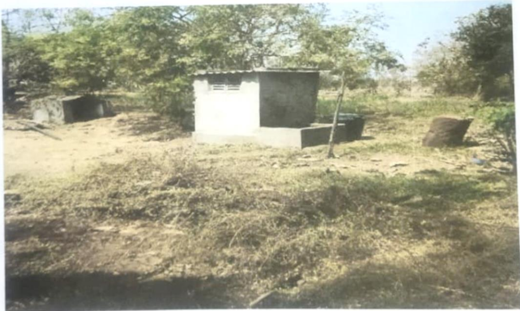
Photos-Biogas Plant at Kandalgaon Kolhapur